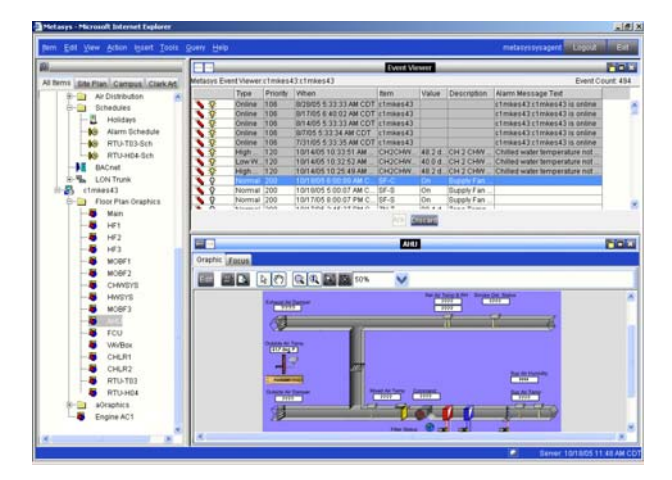
Figure 2: Metasys Site Management Portal Screen

• Metasys Site Management Portal User Interface provides data and graphic screens to supported Web browsers. Authorized users simply log on to the NAE from the Web browser to access the Site Management Portal. This embedded user interface is ideal for smaller networks and remote locations where a dedicated computer platform to support a user interface is not required.